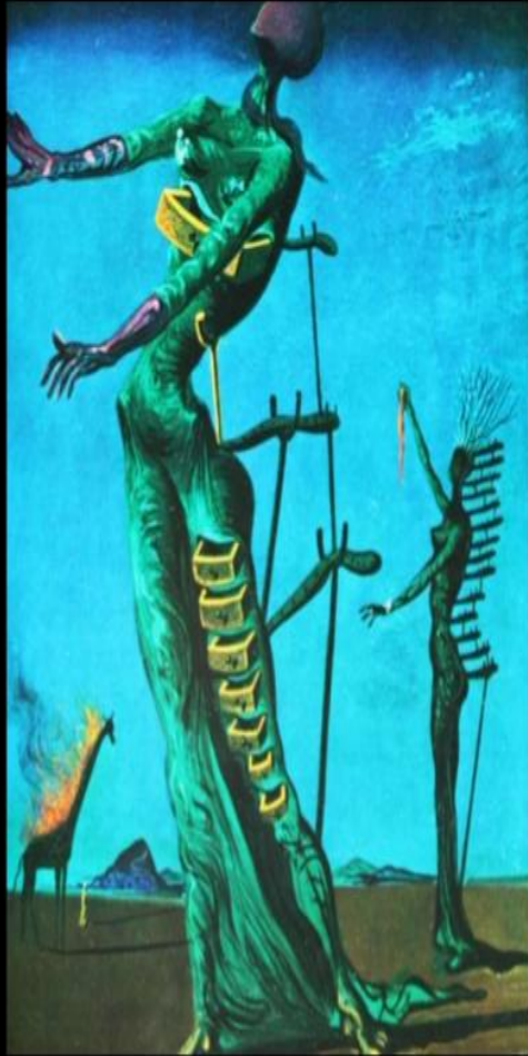
Giraffe on Fire (1937) Salvador Dalí Oil on Canvas

The art world had been forever changed by the visions bequeathed from the omnipotence of the dream world.